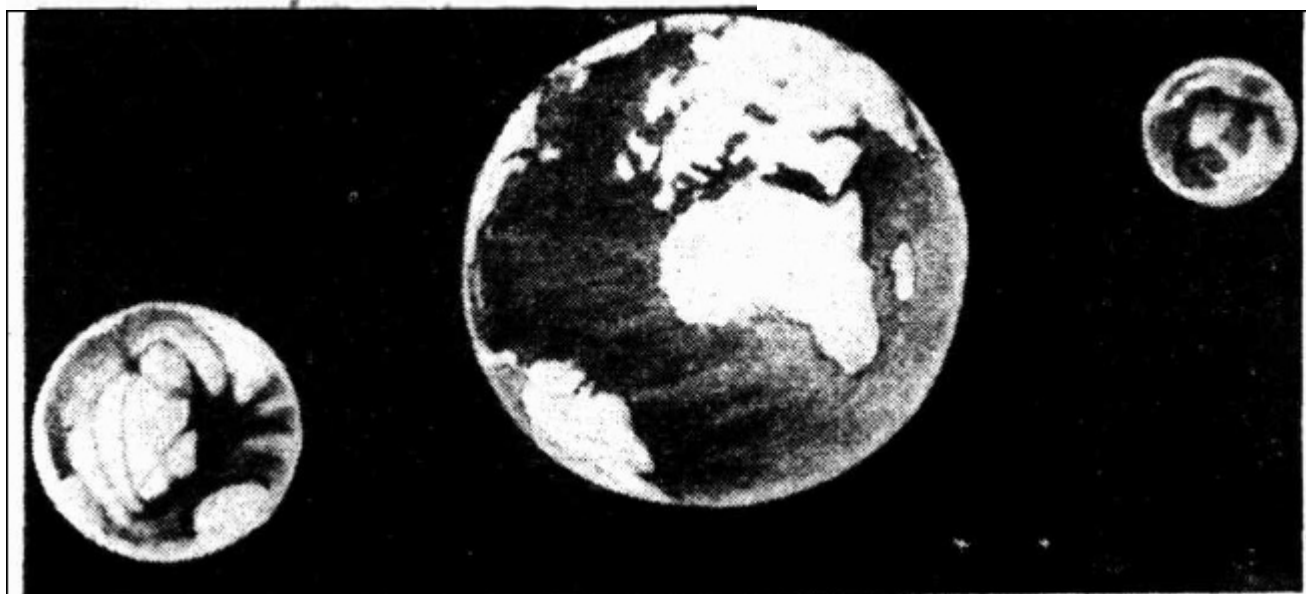
A comparison of sizes: On the left is Mars, in the centre Earth, and on the right the Moon.

The observers gauged its size from that of the moon. Though the object was sailing high it looked several times larger than the disc of the moon.